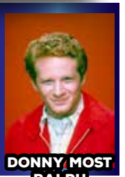
DONNY MOST RALPH