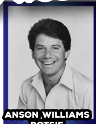
ANSON WILLIAMS POTSIE