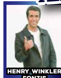
HENRY WINKLER FONZIE